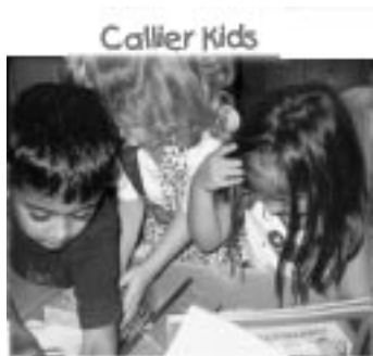
Happy faces, 2002 School Supply Drive

The Staff Development Committee is in their third year of gathering cash and school supplies for Callier Pre-School kids, and hopes to exceed previous years donations. Last year UTD staff donated supplies and cash totaling over $400. That was more than a 40% increase from the previous year.