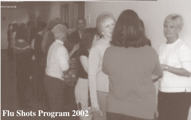
Flu Shots Program 2002