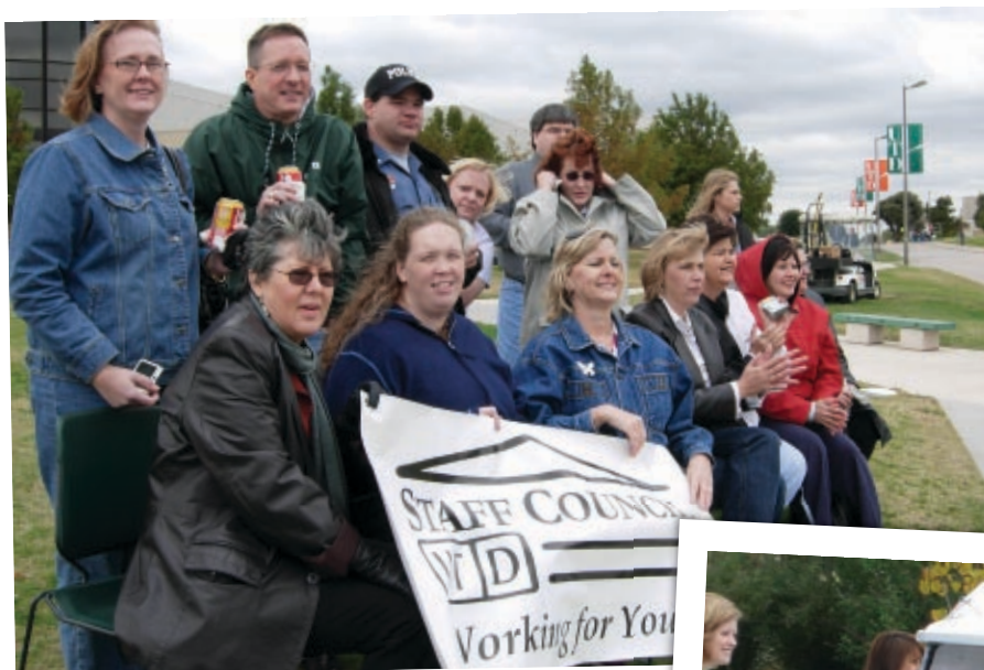
(left) Staff Council representatives cheer on the homecoming floats.