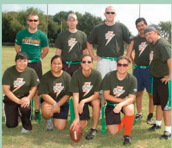
UT Dallas gold-winning Flag Football team.

UT Dallas definitely stepped up and made its involvement in this year's Corporate Challenge an amazing run.