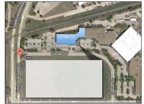
The new UT Southwestern Clinical Center at Richardson/Plano is housed in the former Hewlett-Packard building along Stewart Drive and Waterview.

offering digital radiography and ultrasound services at that time.