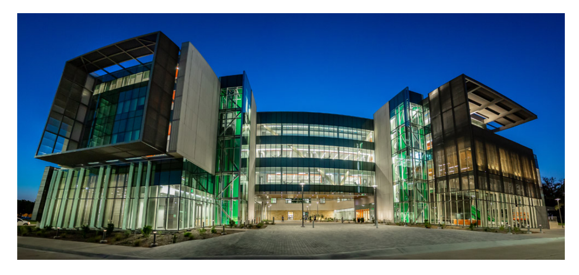
Engineering and Computer Science West (ECSW): A Combination of Innovating Spaces for Creative Thinking and Learning