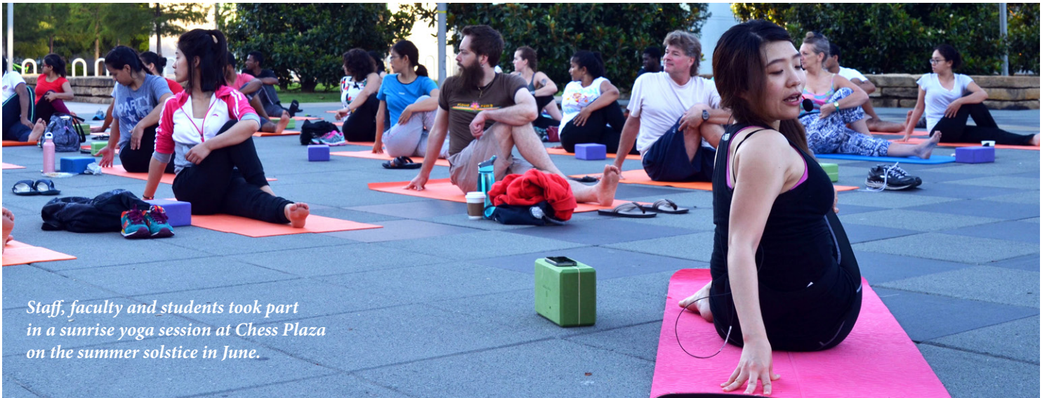
Staff, faculty and students took part in a sunrise yoga session at Chess Plaza on the summer solstice in June.