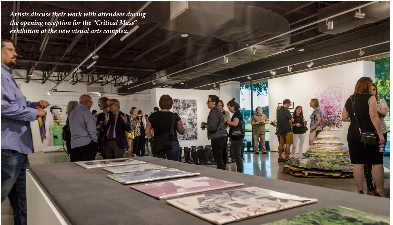
Artists discuss their work with attendees during the opening reception for the “Critical Mass” exhibition at the new visual arts complex.