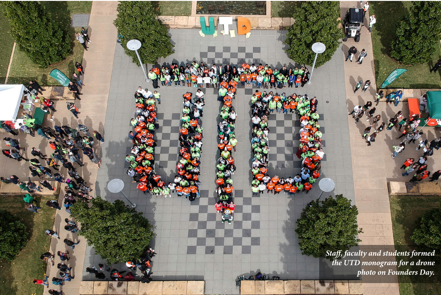
Staff, faculty and students formed the UTD monogram for a drone photo on Founders Day.