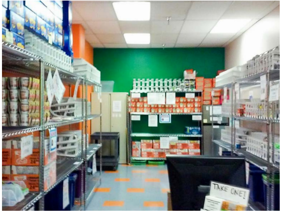
Above: Established in 2012, the Comet Cupboard provides food and essentials to students in need.

While green beans and ramen are a popular donation, think of other vegetables, fruit, soups, rice etc. When thinking of purchasing items to donate they recommend the Dollar Store