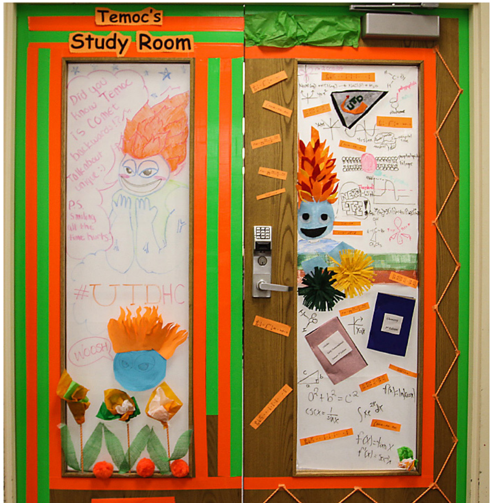
The Academic Bridge program took home the laurels for the 2016 Homecoming door decorating contest.