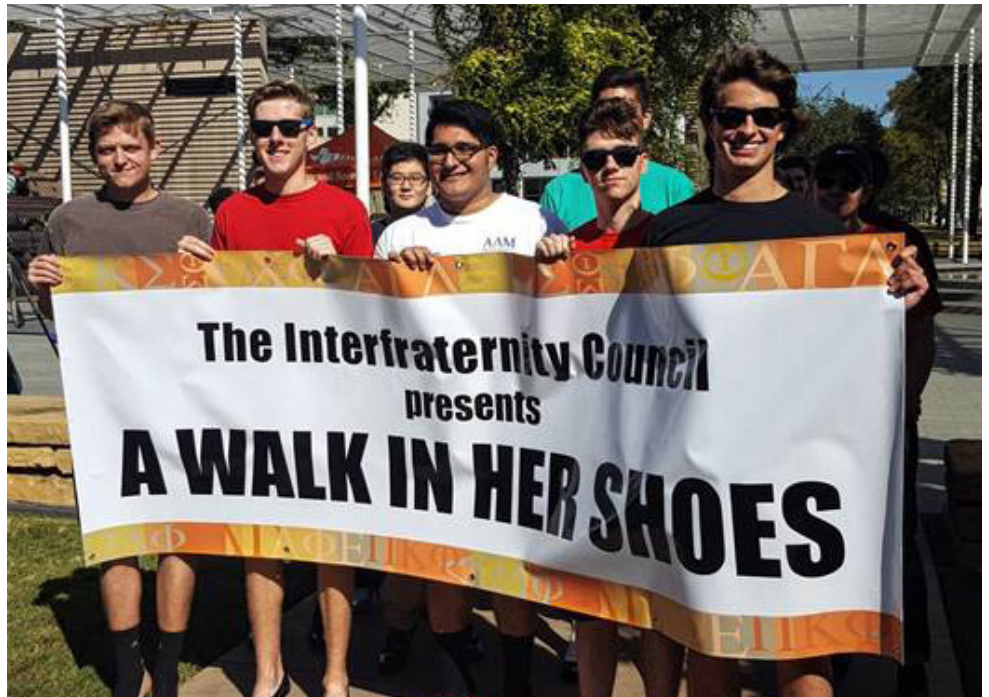
Fraternity members participate in the annual “A Walk in Her Shoes” event.

“A Walk in Her Shoes is an annual event to show that we as fraternity men do not condone sexual assault and domestic violence; we are making a stand and are putting ourselves in victims’ shoes by literally walking around campus in said shoes. This year was particularly impactful because of